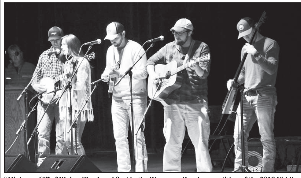
"Highway 60" of Blairsville placed first in the Bluegrass Band competition of the 2019 Fiddlers'

4-point difference deciding Watts as the 2019 Fiddle